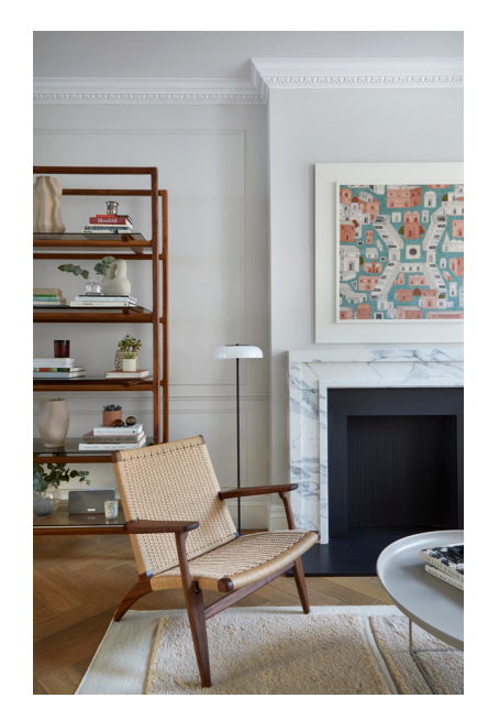
Designed by Studio Sidika and completed in 2021.

Studio Sidika was commissioned to design and project coordinate the complete remodel and refurbishment of this 225-sqm Victorian house. Having grown up in Gibraltar, the owners were keen to maximise the amount of natural light coming into the house. Planning permission was obtained for a double-height window at the rear and Studio Sidika oversaw its design, choreographing the interiors to achieve maximum dramatic effect. They took their cue from Parisian apartments from the Haussmann era and the way they combine a timeless backdrop with classic mid-century pieces.