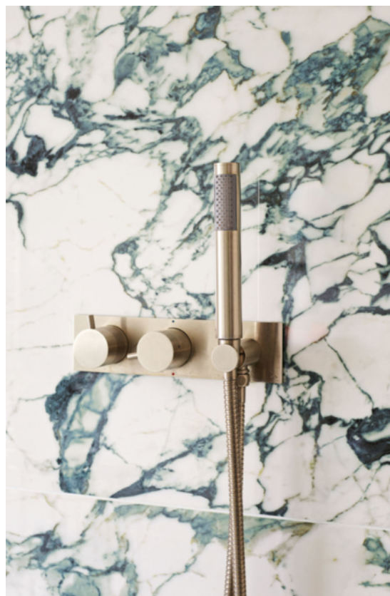
ABOVE The brushed stainless steel finish adds to the luxurious vibe in Emma and Nick's en suite

MPRO two outlet, two handle thermostatic bath valve and handset, £808, Crosswater